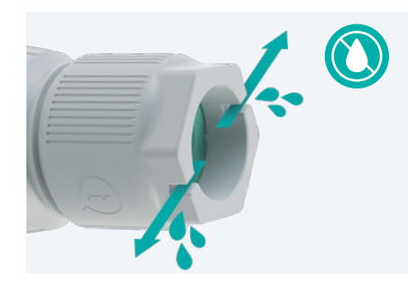
The nut's slits allow water to escape, preventing it from stagnating and getting inside the grommet.